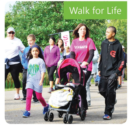
Walk for Life

Mt. Carmel Baptist Church New Banklick Baptist Church New City Presbyterian Church New Hope Community Church New Life Christian Church North Cincinnati Community Church Our Lady of the Sacred Heart Parkside Christian Church Peoples Church Pleasant Ridge Baptist Church Pleasant Run Church of Christ Tri County Assembly of God Missions Trinity Reformed Episcopal Church Veritas Church Vineyard Cincinnati West Chester Church of the Nazarene White Oak Christian Church World Outreach Christian Church